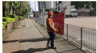
Site staff is hitting the gong as a warning sign