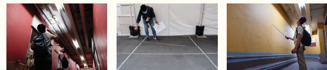
Surveyors conducted visual inspection, measured the length of the cracks on structures and assessed the structural integrity by suitable instruments

Surveyors of the contractor will generally conduct visual inspections and make use of suitable instruments such as measuring tape and hammer percussion during inspection. Surveyors will also take photos, measure and record the condition of internal and external structures of the building. All works will be conducted in a safe manner and there will be no disturbances to the residents.