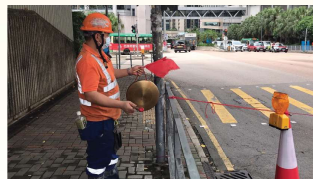
Notice with on-day blasting schedule